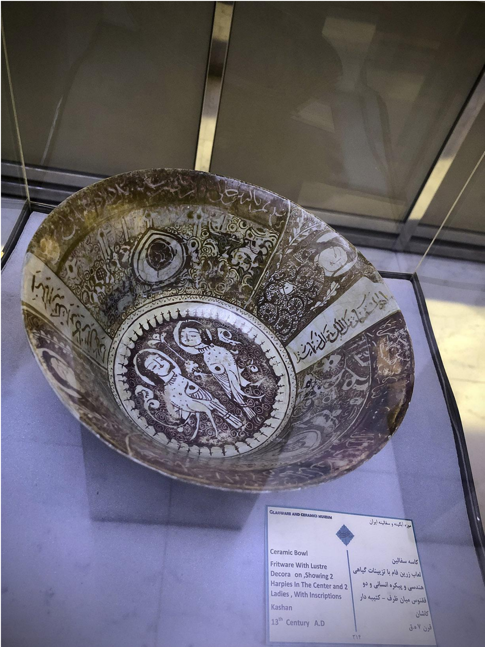
A Romance in A Bowl - Fatemeh.

Cultural History again. Artistic circumvention of rules against representation