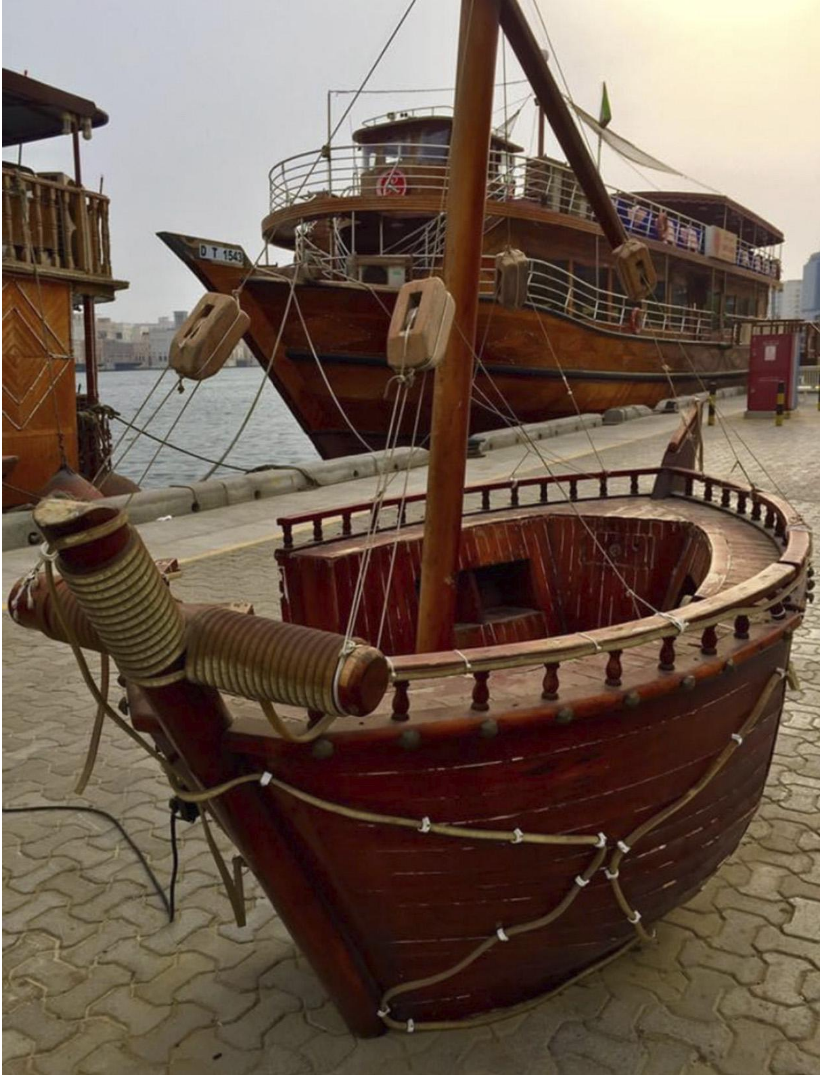
In the Old port of Dubai. Nowadays used as tourist boats.