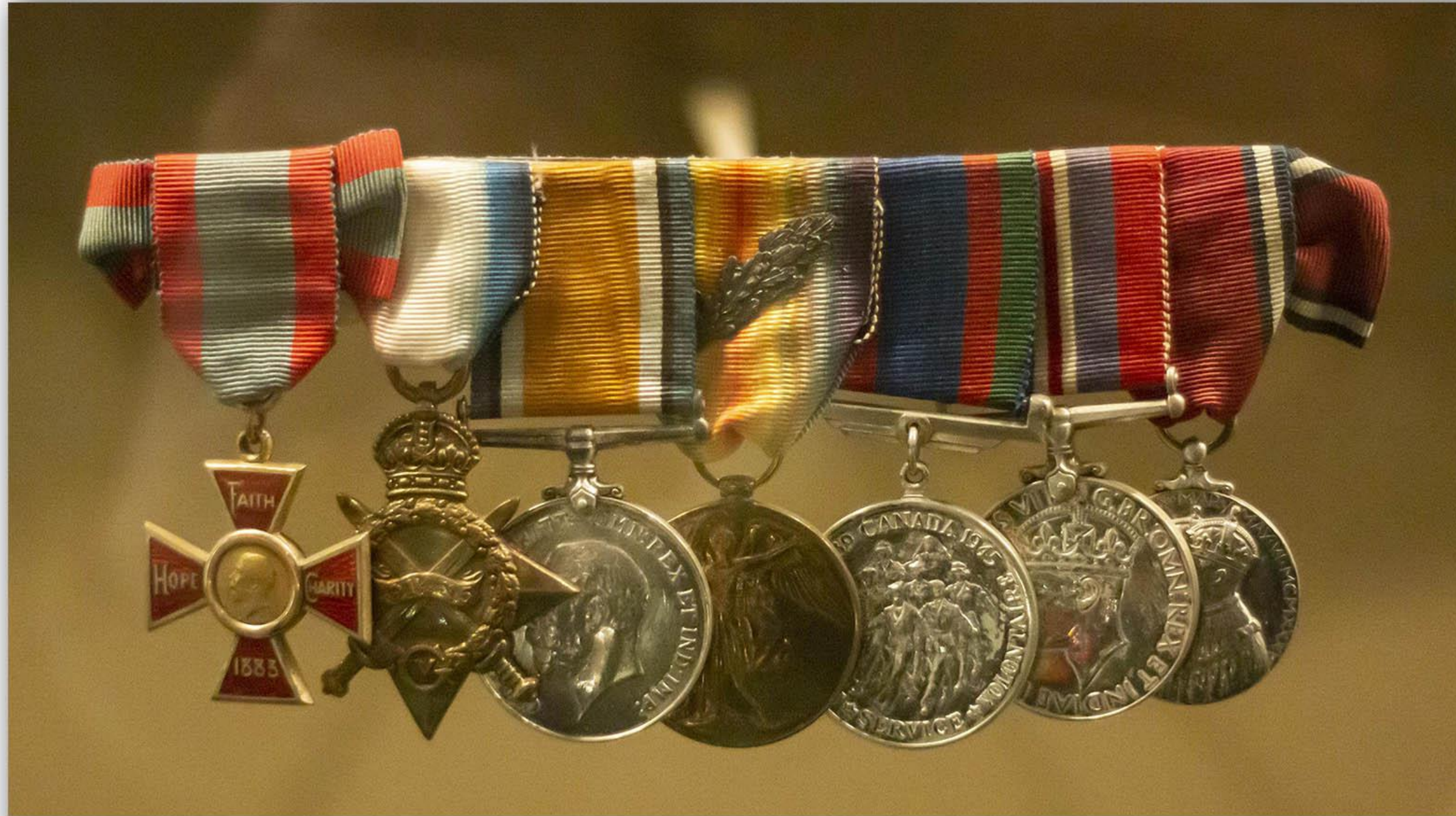
The Greatest Of These - Bill