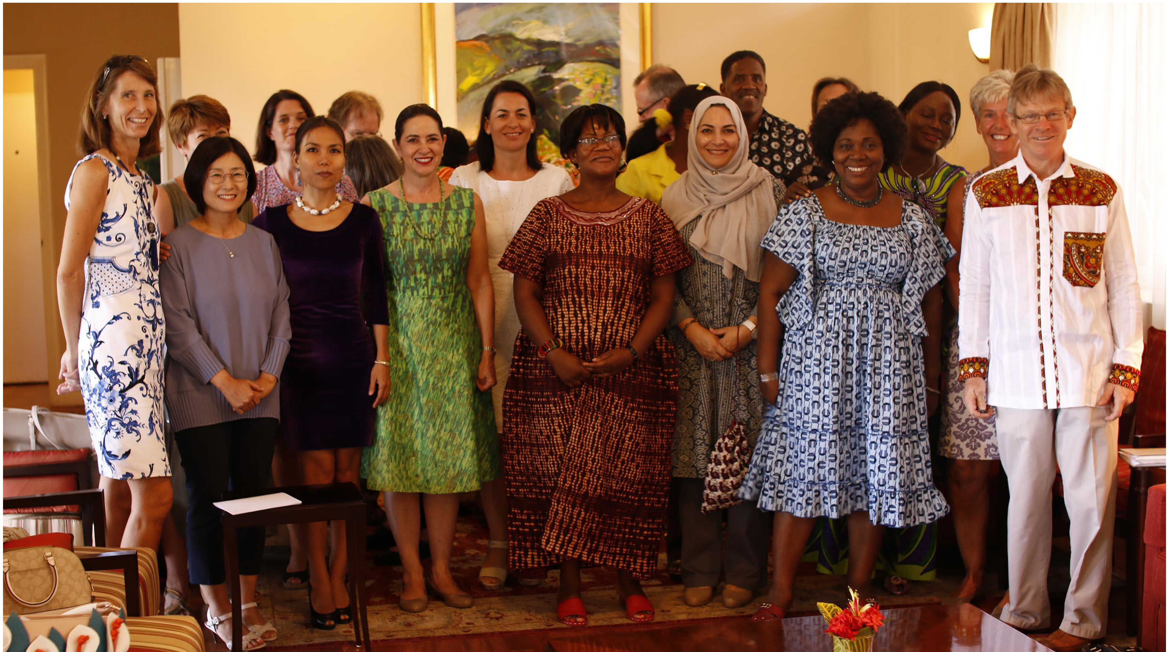
Where it All Began? ASOHOM, 2017, Canadian Residence. Who's part of your history?