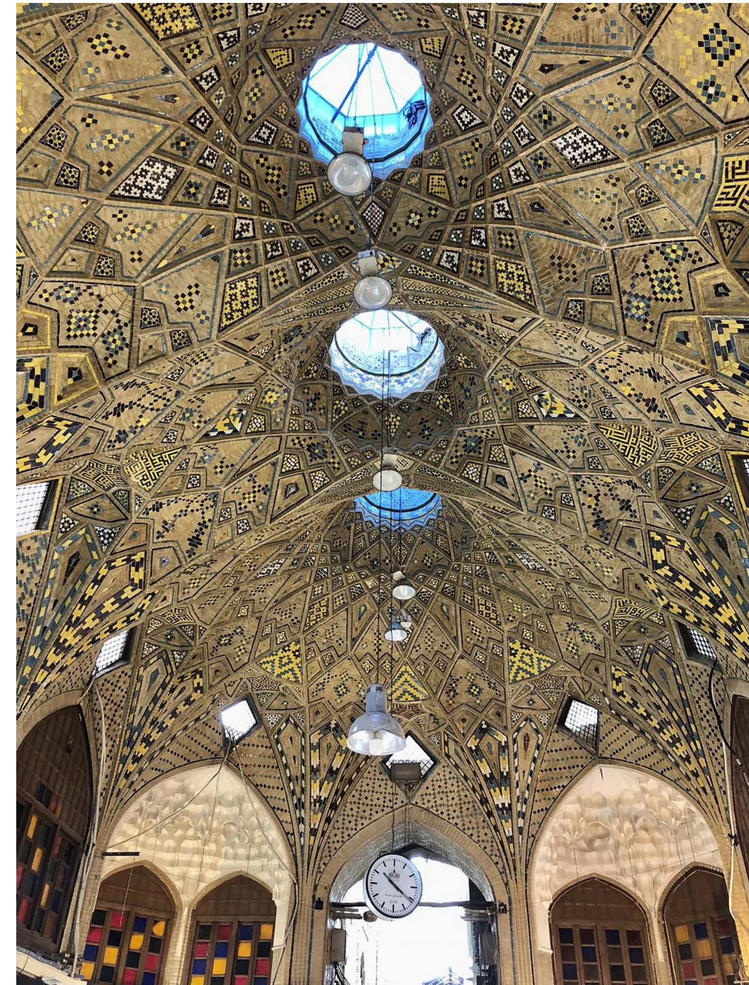
The Victory of Light Over Darkness - Fatemeh Aspirations. #FatemehStrong