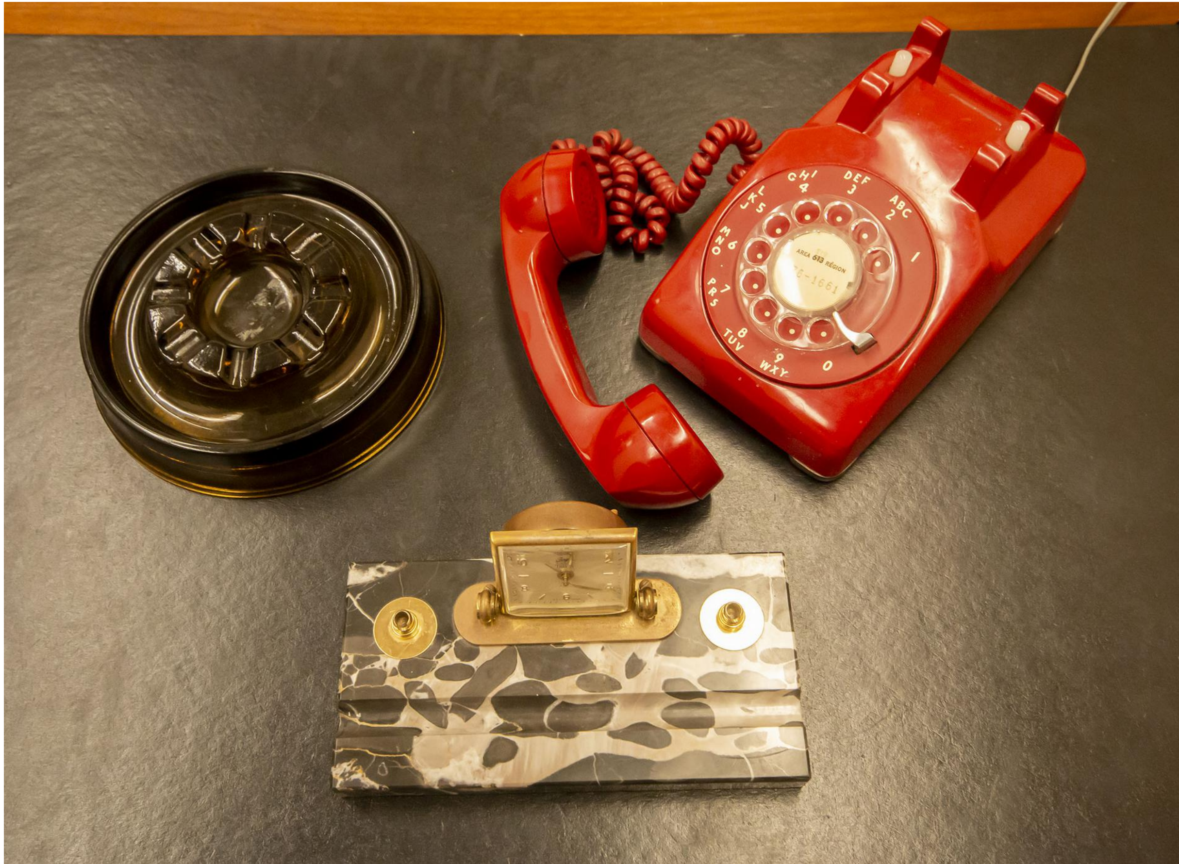
The Prime Minister's hotline in the Historical Nuclear Bunker in Canada. How close to disaster it could have been.